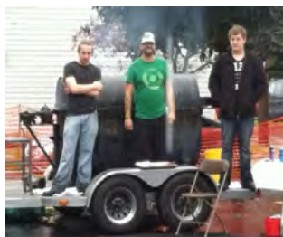
The guys 'guarding the pig'