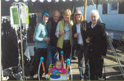
Four generations celebrating the Clinic at The Cooks' House!

The Cooks' House 2nd Annual 'Party with the Pig' raised $4,729 for the Clinic's CHAP program