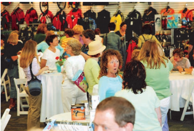
Wine, Women and Wheels at Brick Wheels 2010 raised the Clinic $5,200!

Black Star Farms donated $450 to the Clinic following a steady day of tasting room sales.